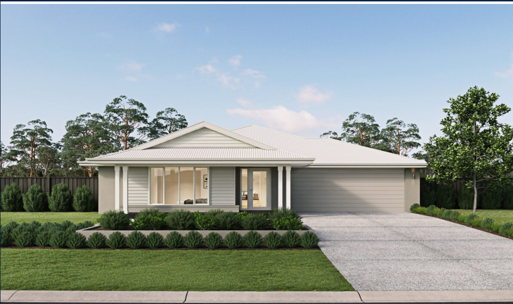
Price excludes upgrade items above standard specification such as feature render and bricks, front entrance timber decking, front entry door, brick infills above garage, external lighting, fencing, concrete paths and driveway. Façade Image may also contain items not supplied by Metricon Homes, namely landscaping and planter boxes.